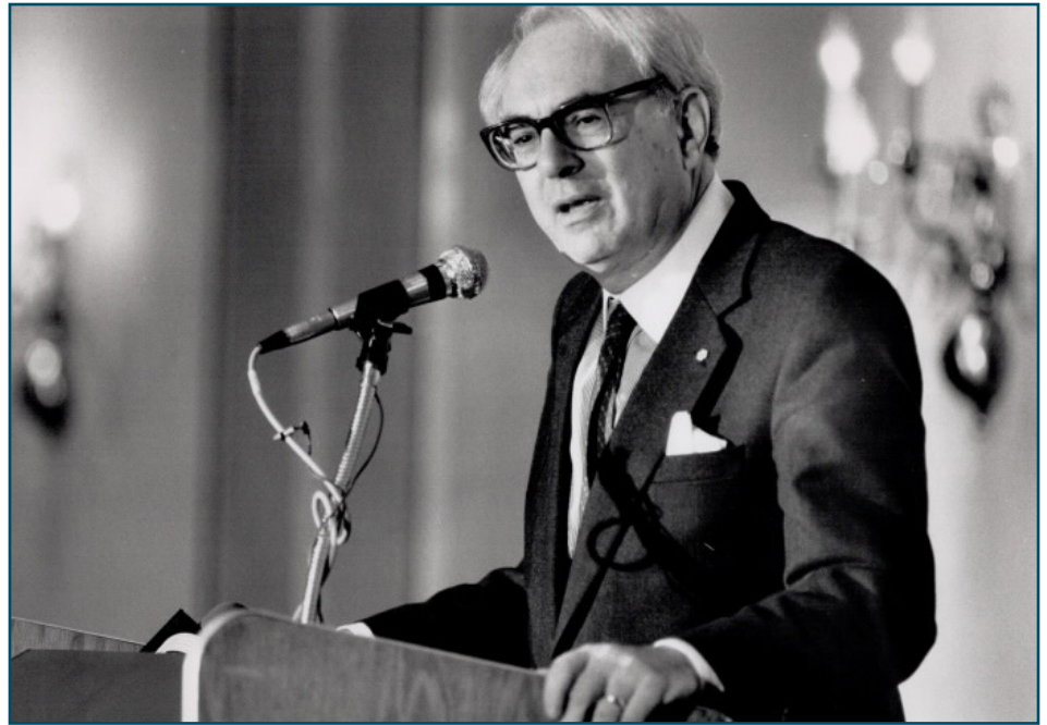
Allan Gotlieb

His rise through the ranks was rapid. After a posting in Geneva, and ten years after joining the Department, he was appointed assistant under-secretary of state for external affairs and legal adviser. He was subsequently appointed deputy minister of Manpower and Immigration in 1973, and in 1977 became under-secretary of state for external affairs. In 1981 he was