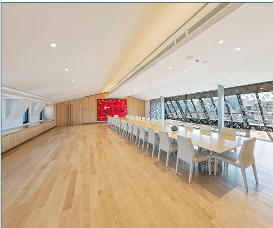
Les matériaux canadiens rendent hommage au Canada partout dans l'ambassade. Salle de conférence du 6 ème étage.

Gérald Cossette – Le texte est une adaptation d'une circulaire d'AMC.