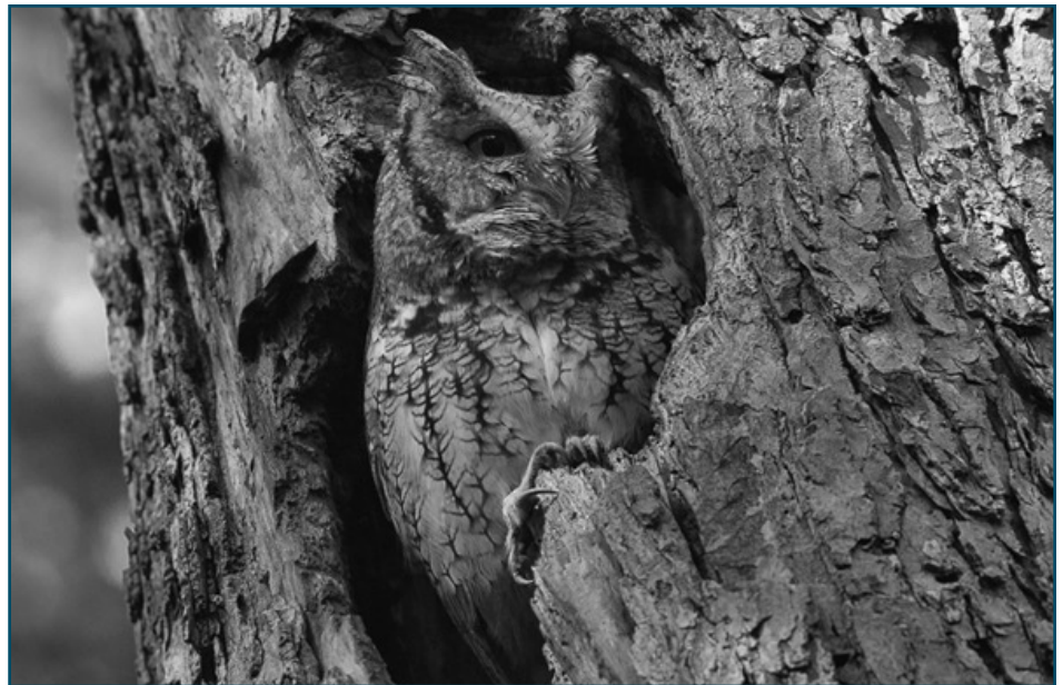
Eastern Screech Owl